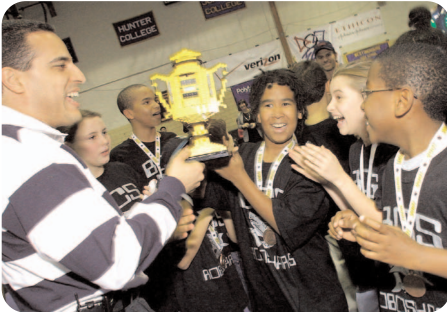
FLL: SPORT FOR THE MIND continued